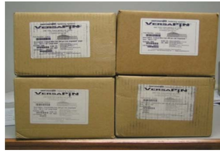
Boxes of Gripshank Pins as shipped