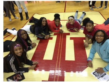
SMS Girls' Basketball visiting IU