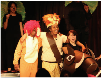
Two sold-out shows of the school musical The Lion King