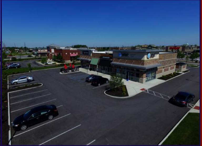
Villages at Anson Building II