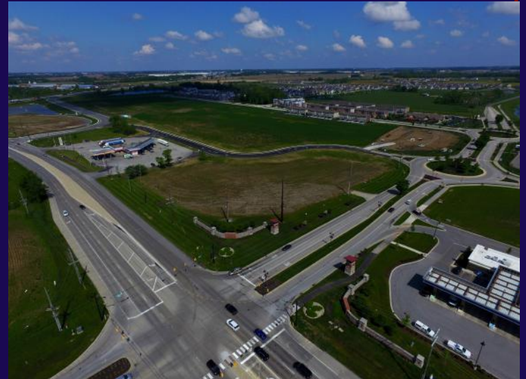
Villages at Anson IV Site - AVAILABLE