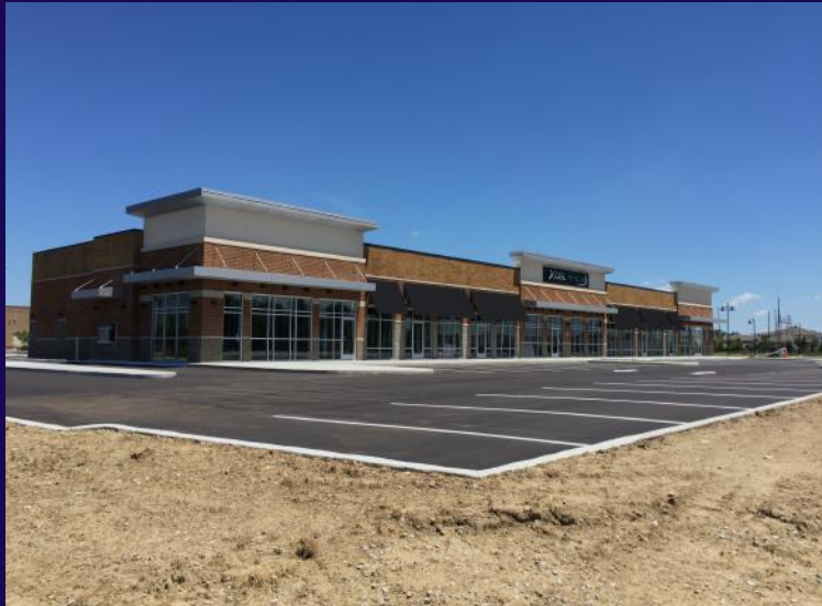
Villages at Anson Building III