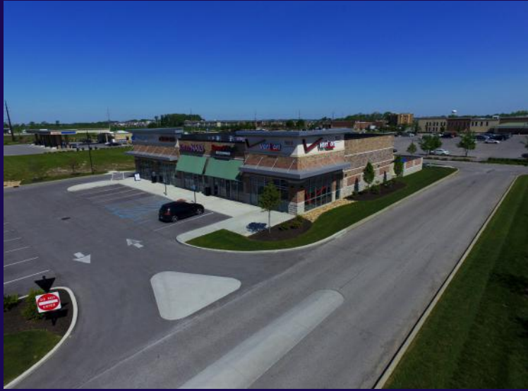
Villages at Anson Building I